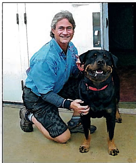
SOUL MATES: BUMBLE AND 4-TIME OLYMPIC GOLD MEDALIST GREG LOUGANIS (DIVING) BECAME GOOD FRIENDS AT THE AKC NATIONAL AGILITY CHAMPIONSHIP.