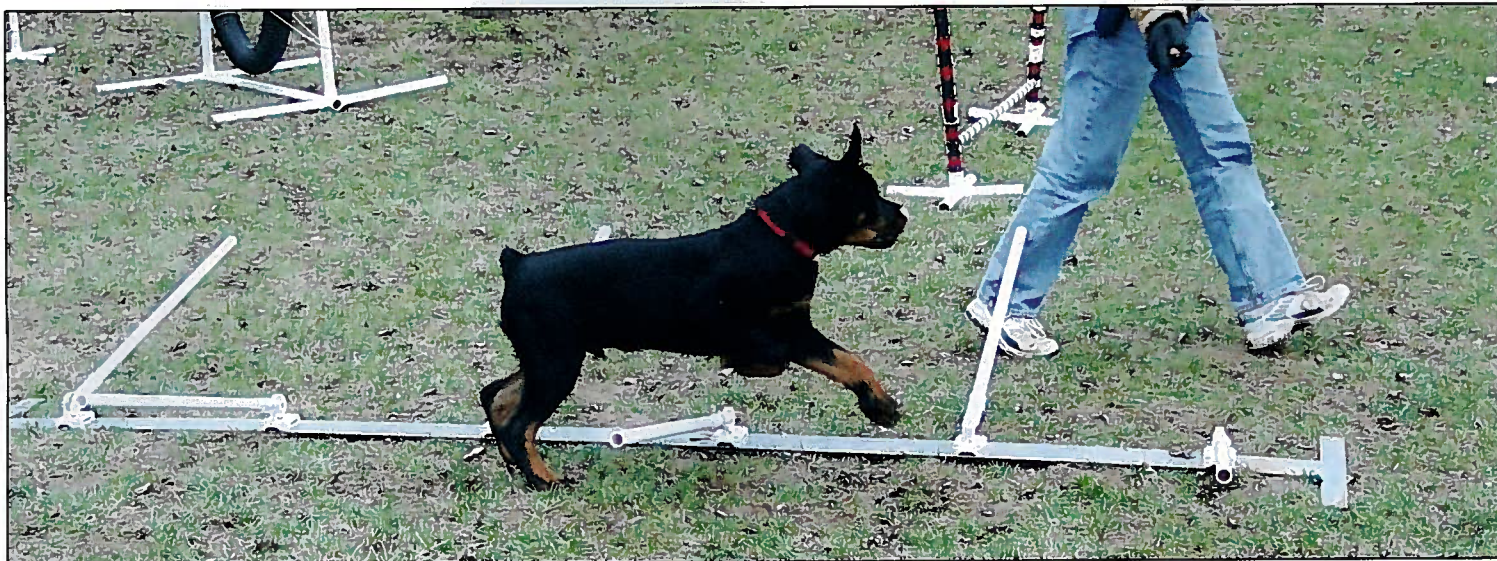
BUMBLE'S EARLY AFFINITY FOR THE WEAVE POLES WAS FUELED – OR SO IT WOULD APPEAR – BY HIS TASTE FOR HOTDOGS!