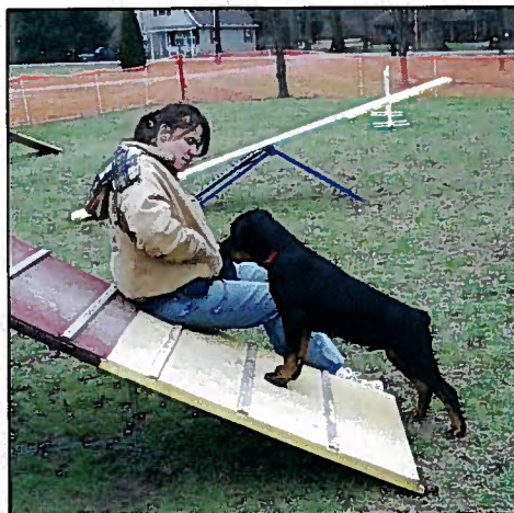
BUMBLE'S STRIVE FOR THE TEMPTING TIDBIT CONTINUED ON THE A-FRAME.

Bum is incredibly smart and earned his first rally novice leg at 9 months. The day